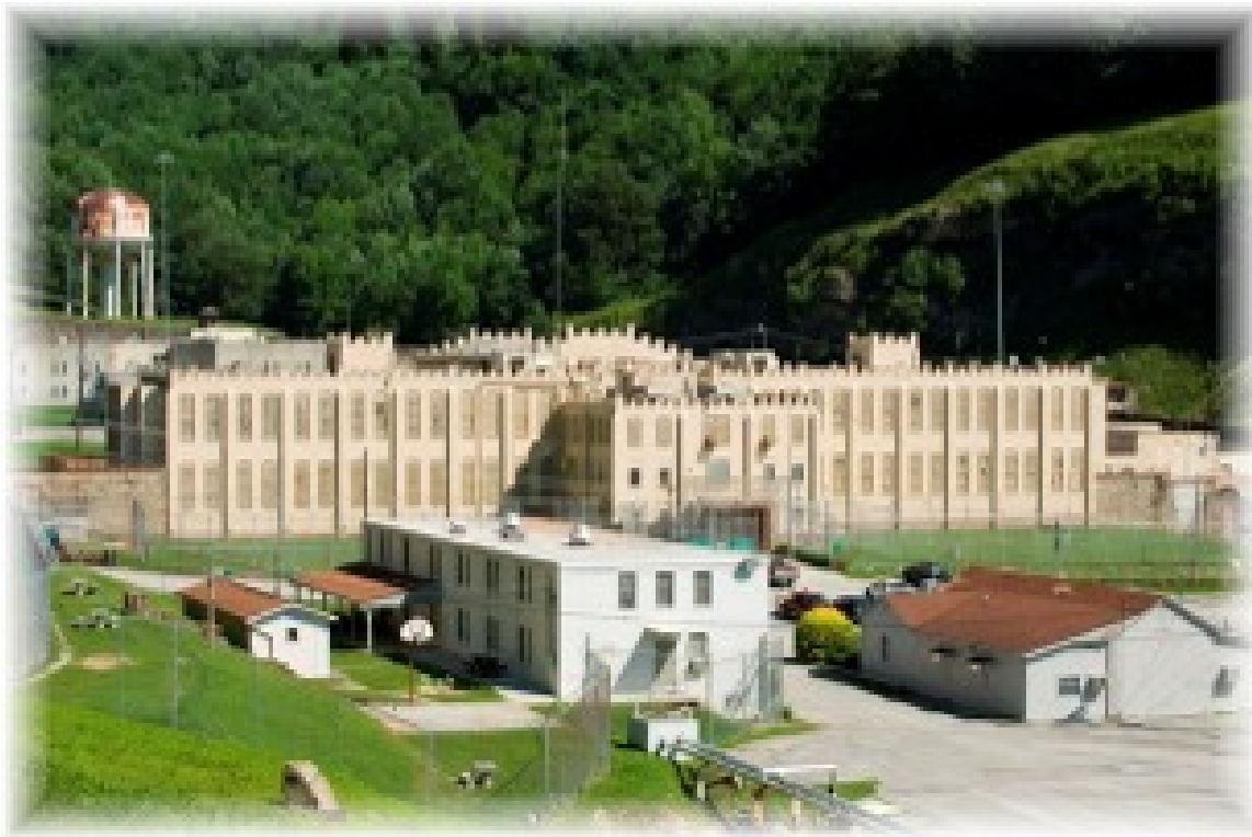
2009—Brushy Mountain Correctional Complex Closes