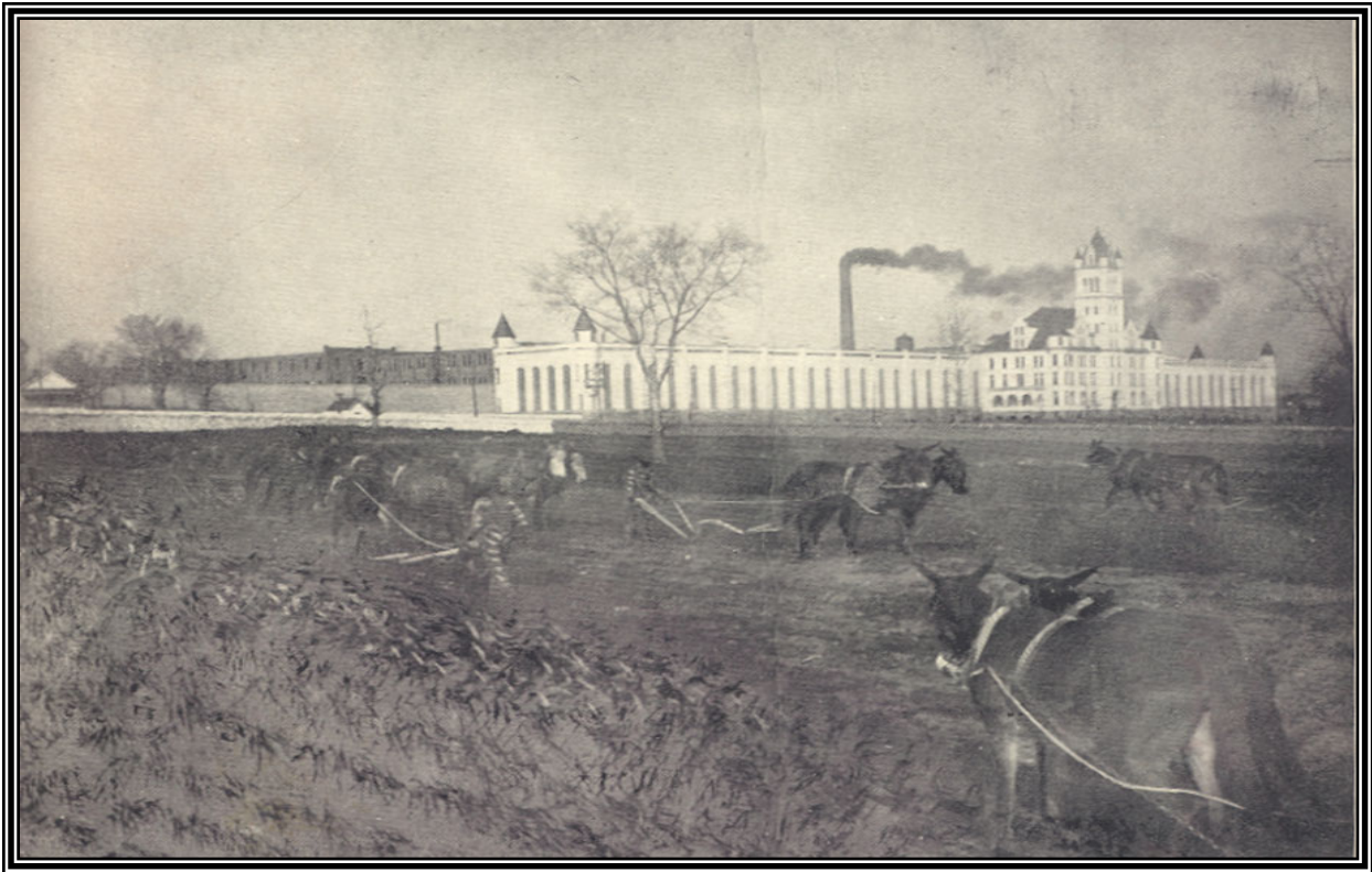
1897—State Prison Farm