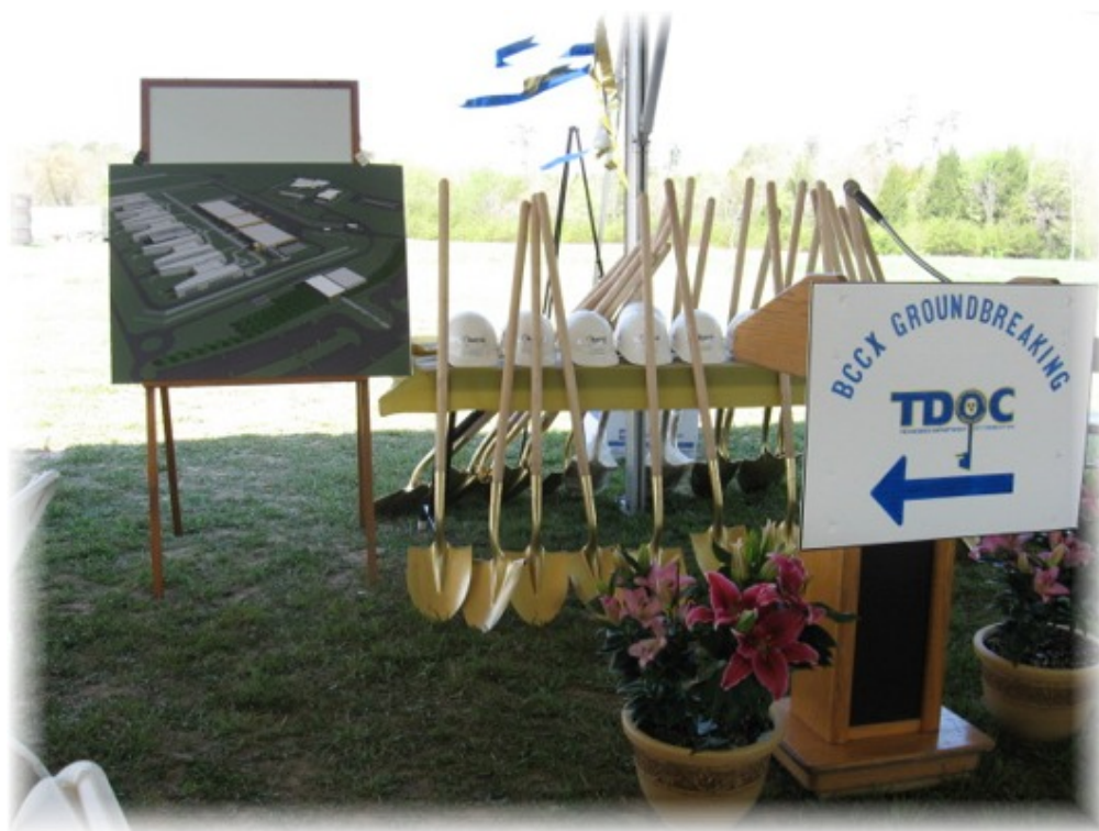
2010—Bledsoe County Correctional Complex Groundbreaking Ceremony