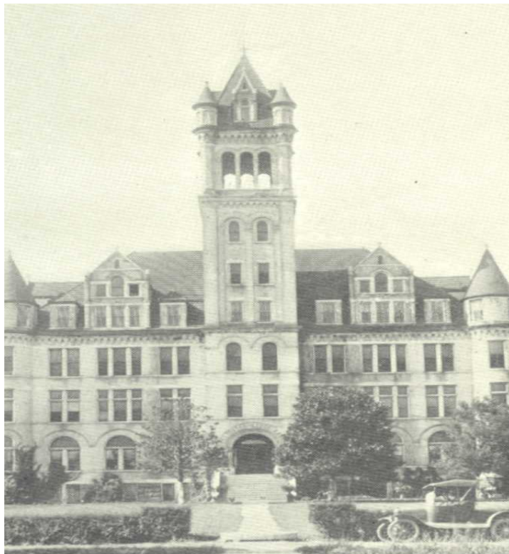
1922—Tennessee State Penitentiary