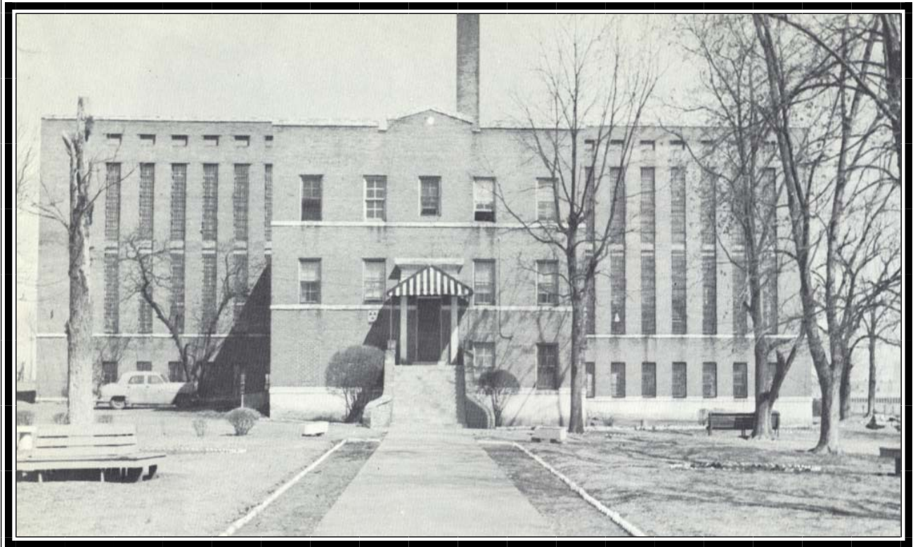
1966—Tennessee State Penitentiary—Women's Unit