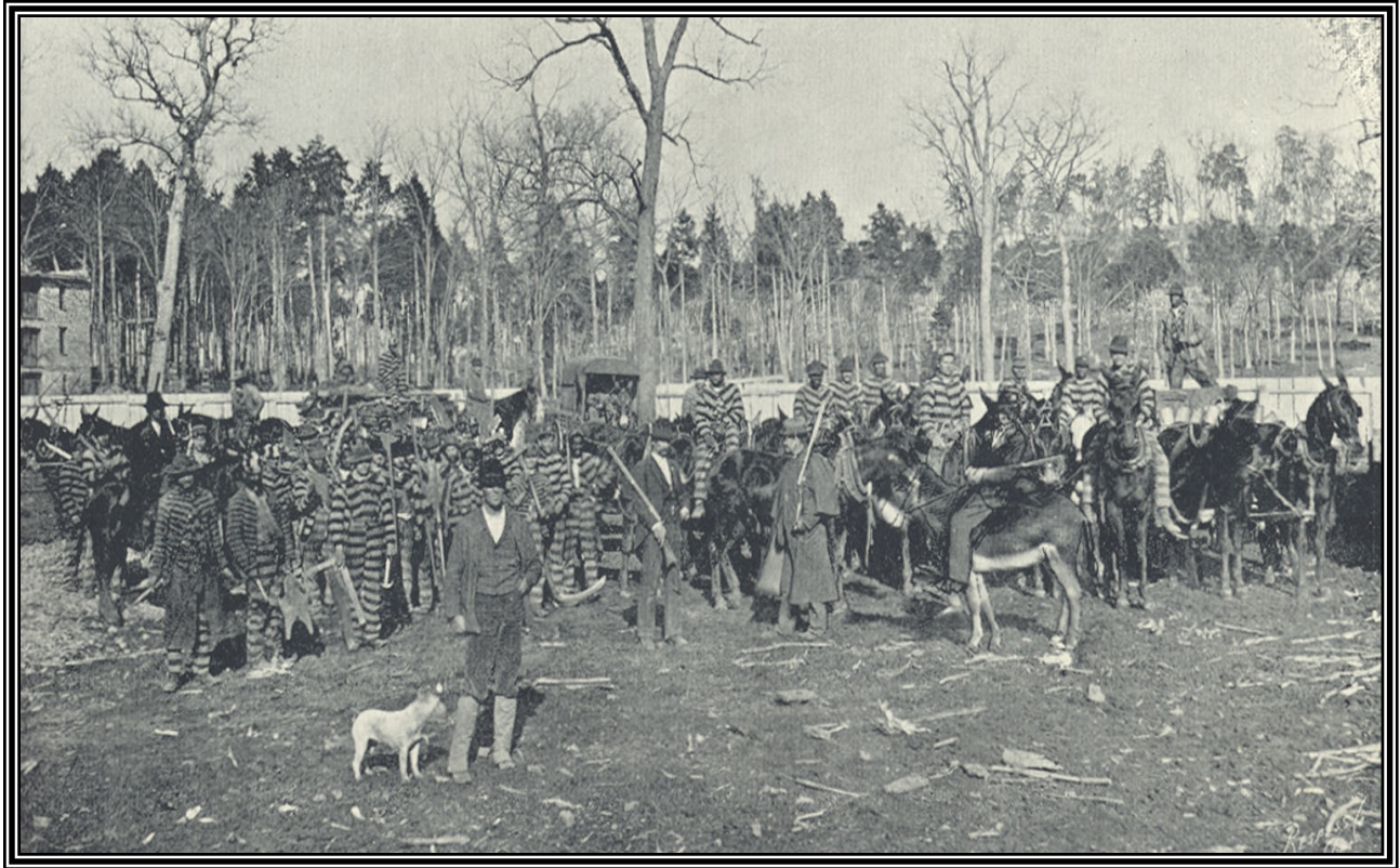
1902—Main Prison in Nashville