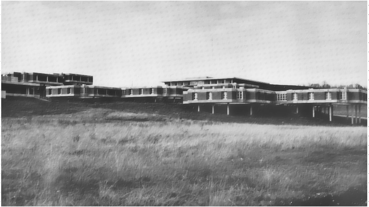
1970—Turney Center and Industrial Prison