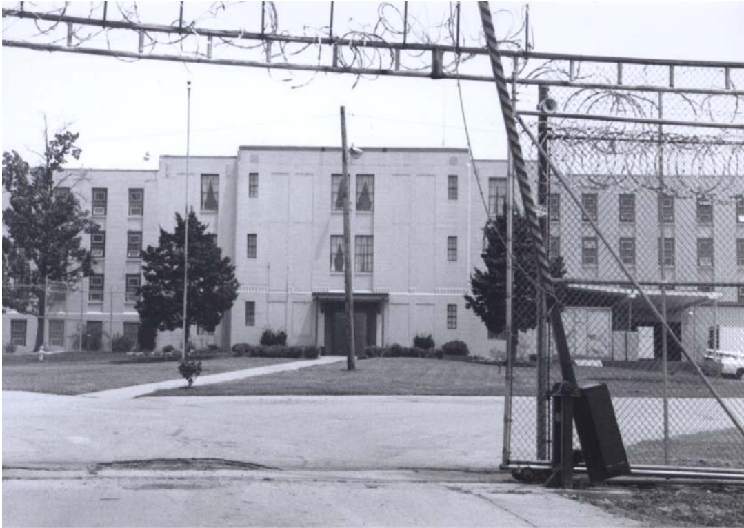
DeBerry Correccional Institute

Tennessee Offender Management Information System (TOMIS) implemented