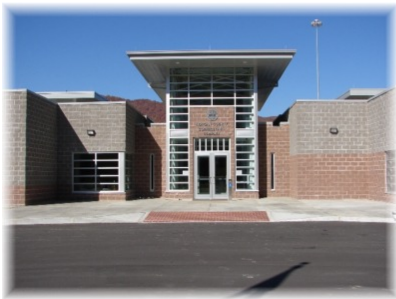
2009—Morgan County Correctional Complex

Beginning June 1, 2010, the time for carrying out capital punishment sentences will be moved from 1:00 a.m. to 10:00 p.m.