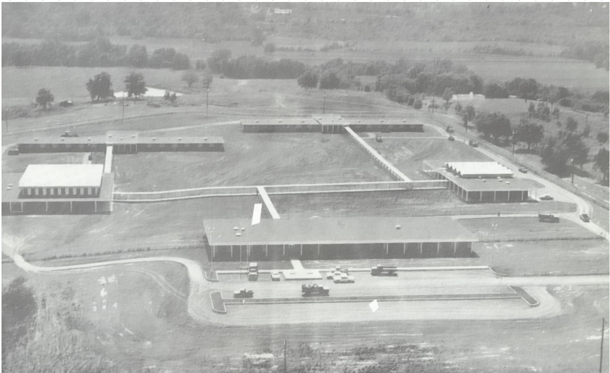
1970—Tennessee Prison for Women