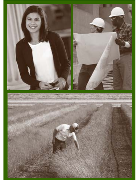
High Growth Industries 2008-2018 in LWIA 3

A new addition to this publication is the Green Jobs information located on the third page. These are the largest occupations in this part of the state that have job responsibilities in the areas of energy efficiency, environmental protection, clean fuels and other innovative practices. It was collected over the past year from a survey conducted by TDLWD.