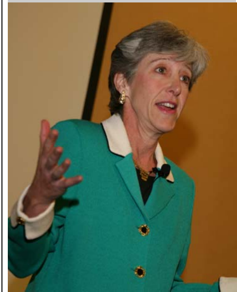
Below: 2008 Economic Summit for Women keynote speaker Robin Gerber