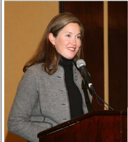
Below: At the 2008 Economic Summit for Women, Senator Jamie Woodson addresses legislation affecting Tennessee women