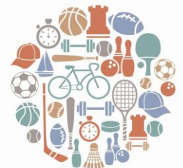
CHILDREN'S ADVOCACY DAYS 2014 The Sport of Advocacy