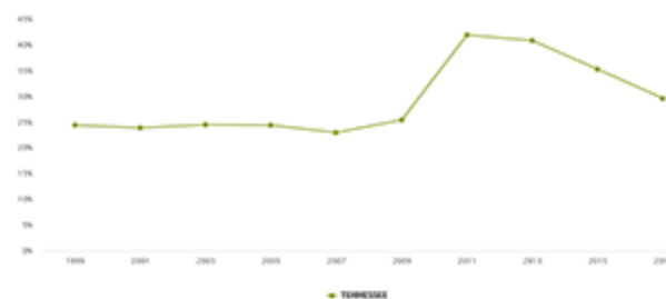
Infants And Children Receiving WIC Benefit (Percent)

Tennessee Commission on Children and Youth KIDS COUNT Data Center, datacenter.kidscount.org A project of the Annie E. Casey Foundation